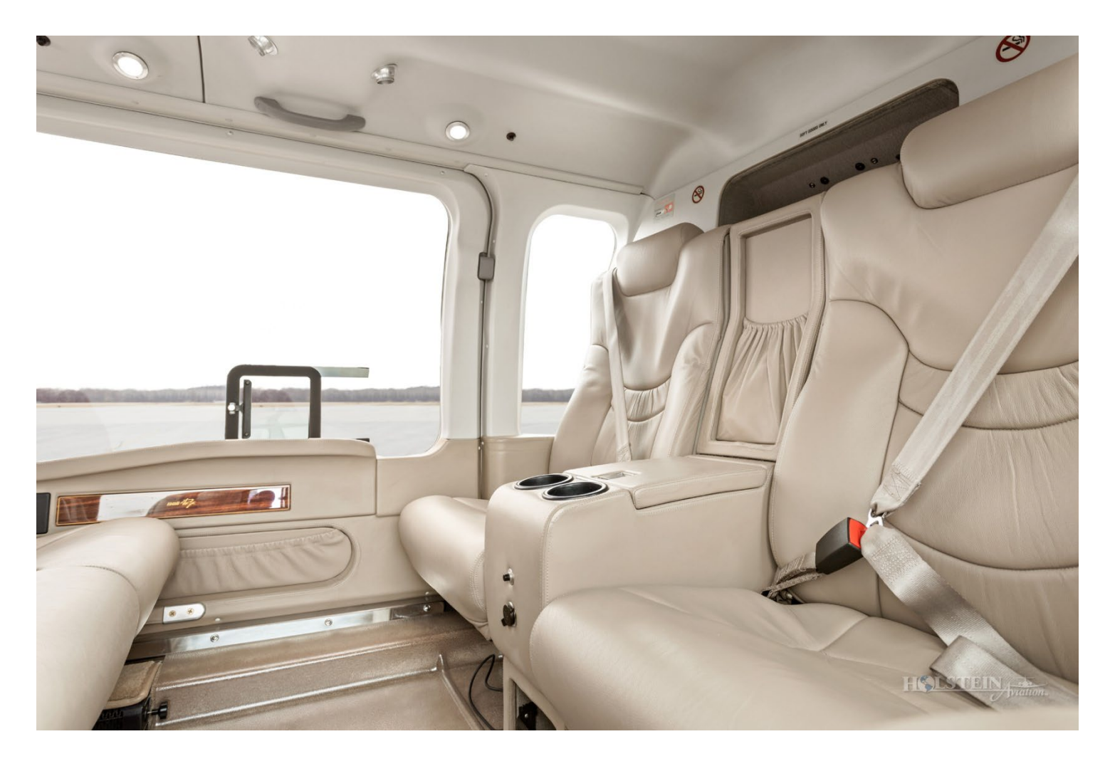
Specifications subject to verification upon inspection. Aircraft subject to prior sale without notice.