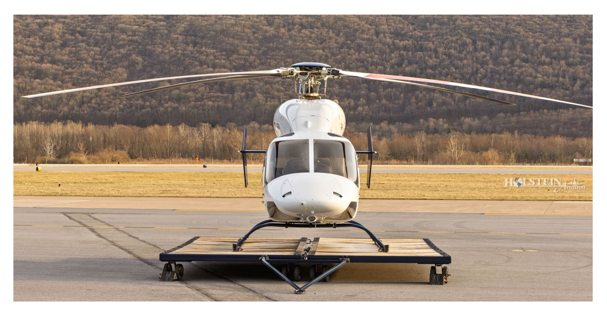
Specifications subject to verification upon inspection. Aircraft subject to prior sale without notice.