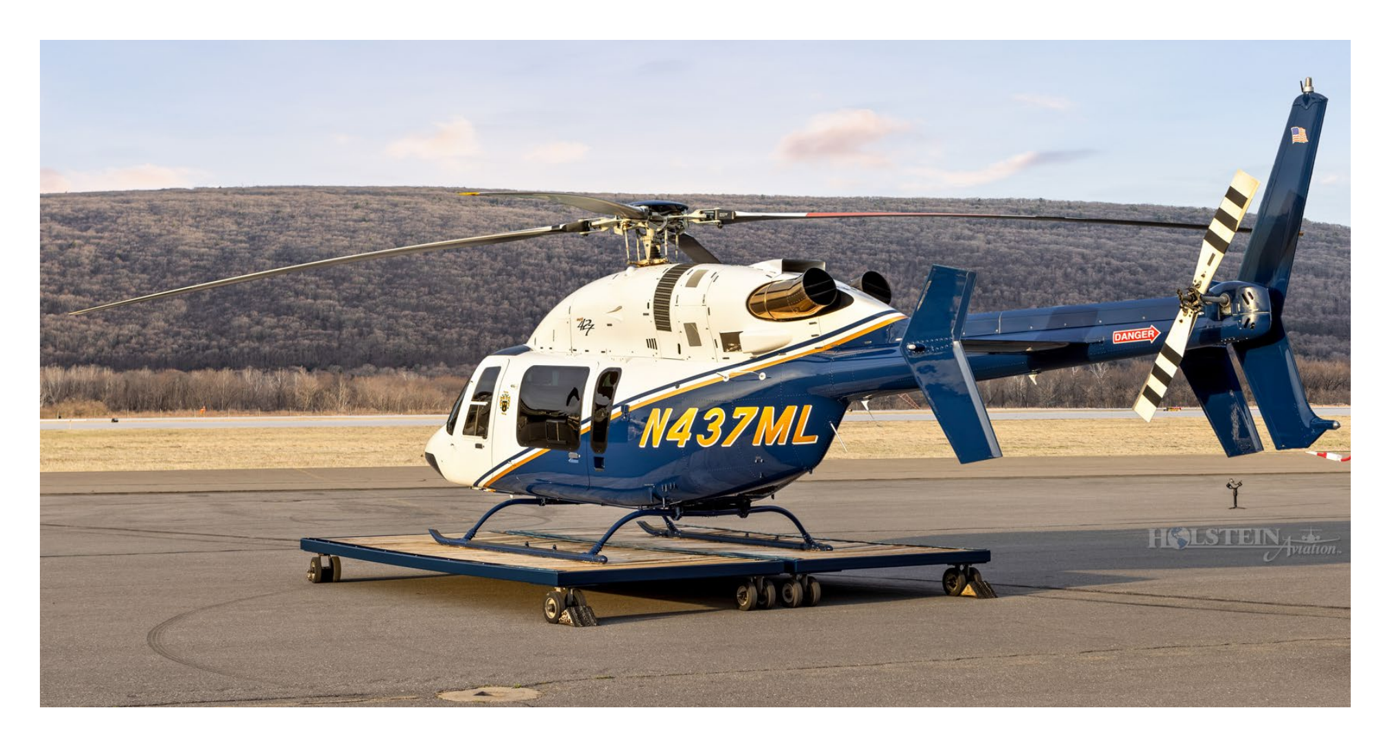
Specifications subject to verification upon inspection. Aircraft subject to prior sale without notice.